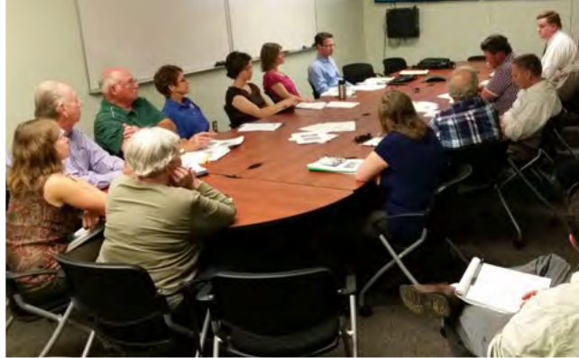
Stakeholder meetings helped the County better understand how residents perceived solar power.