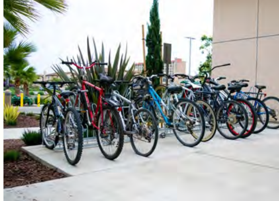
Left to right: Dedicated bike lanes on streets like Santa Marguerita and Cathedral Oaks make biking safer and more enjoyable, according to community feedback. Large and expanding UC Santa Barbara student housing complexes, where bike use is ubiquitous, sit just south of the Goleta city boundary. UCSB has extensive bike paths across its campus, and one of the City's goals will be to integrate these with their own into a network that serves commuting and recreational needs across the Goleta, Santa Barbara, and the surrounding unincorporated areas.

Planning were instrumental in making the community workshops a success, and in partnership with Public Works, reviewed proposals and selected a consultant to produce the final plan. The team effort required to initiate the Plan and gather community feedback has fostered teamwork and comradery, strengthening cross-departmental relationships.