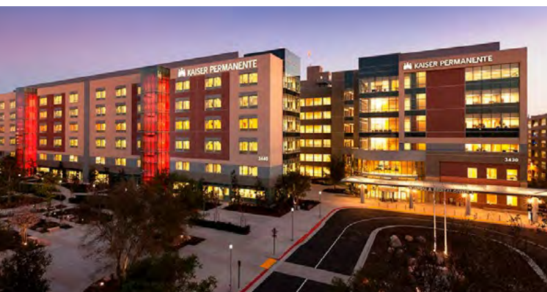
Above: Incorporating Complete Streets and Green Streets features will offer a more sustainable environment that expands mobility and access at the human scale. Below, left to right: Major employers such as Kaiser Permanente provide high quality jobs in Anaheim Canyon. Community members and area stakeholders provided feedback during a Community Workshop. Installing off-road bicycle amenities will broaden bicycle and pedestrian connectivity.