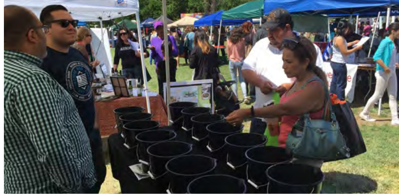
Participants learn about CAPtivate via hands-on activities at the Farmers' Market in Downtown Riverside.