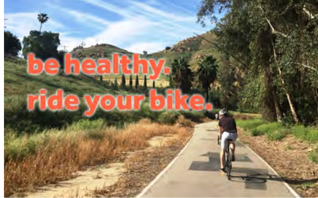
Graphic ads used to promote the health benefits of climate action measures.

participating cities have voluntarily committed to a participation level that can be implemented given their specific community constraints and opportunities. These levels range from “Silver” level programs, smaller initiatives that could be promoted through a city’s website, to “Platinum” level programs that require codification through a local ordinance. Communities that committed to Gold and Platinum level programs achieved more greenhouse gas reductions with fewer programs, but Silver level programs offered cities more flexibility to implement the plan even in the face of opposition within their City. In addition to committing to a level of action, each city defined 2020 progress indicators, measureable outcomes that will confirm the city is on track to meet its pledge.