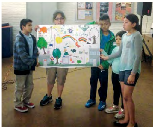
Community members of all ages provided input on ideas and priorities, as a result of the County’s many engagement activities.