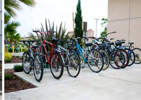
Left to right: Dedicated bike lanes on streets like Santa Marguerita and Cathedral Oaks make biking safer and more enjoyable, according to community feedback. Large and expanding UC Santa Barbara student housing complexes, where bike use is ubiquitous, sit just south of the Goleta city boundary. UCSB has extensive bike paths across its campus, and one of the City's goals will be to integrate these with their own into a network that serves commuting and recreational needs across the Goleta, Santa Barbara, and the surrounding unincorporated areas.

Planning were instrumental in making the community workshops a success, and in partnership with Public Works, reviewed proposals and selected a consultant to produce the final plan. The team effort required to initiate the Plan and gather community feedback has fostered teamwork and comradery, strengthening cross-departmental relationships.