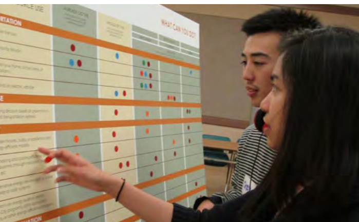
At the City's Resource Efficiency Fair, residents give feedback on what kinds of energy efficiency actions they participate in or would consider participating in.