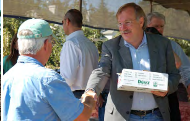
Government representatives learn about opportunities to bolster the region's ag economy on 2008 RUCS' farm tours.