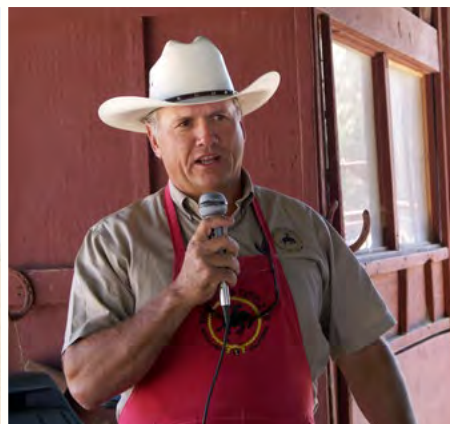
In 2008, SACOG engaged a range of local farmers and agricultural enterprises, including Yolo Land & Cattle Co, to host agricultural tours, with the aim of educating government representatives about the production, processing, transportation and regulatory challenges and opportunities.