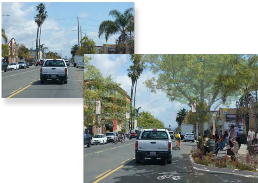
Illustrations of mobility and mixed-use development helped the community to formulate policies that will enhance livability and safety.