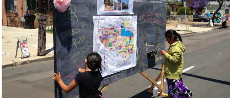
An award-winning community engagement program resulted in new ideas and input from many residents new to planning.