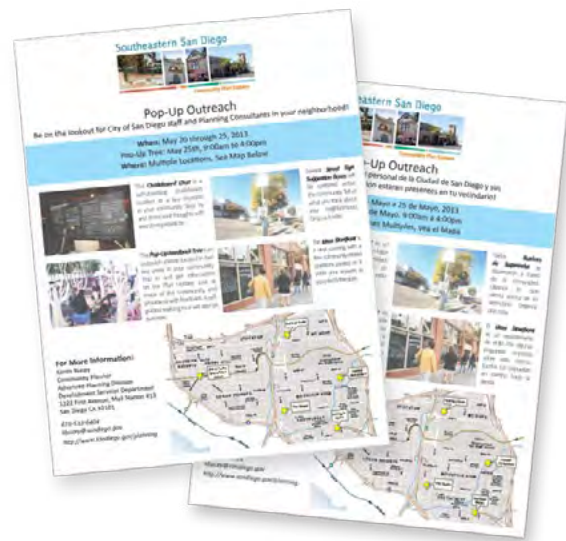
Examples of the City of San Diego community outreach that resulted in new ideas and input from many residents new to planning.

When added together, these plan components will enhance Southeastern San Diego as a fantastic place that retains existing residents and businesses and attracts new ones, thereby achieving significant