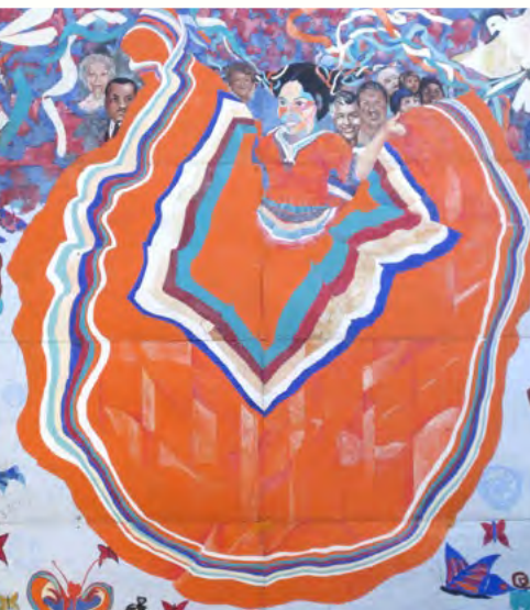
Arts and culture recommendations reinforce community identity by connecting the past with the present and future.

departments, disciplines, and agencies. The Internal Working Group included representatives from the Fire, Police, Transportation, Development Services, and Park & Recreation (including Open Space division) Departments, as well as the San Diego Metropolitan Transit System. Internal Working Group members became the coordinators for their departments' review and input on the incremental technical studies and draft plan materials prepared during the planning process.